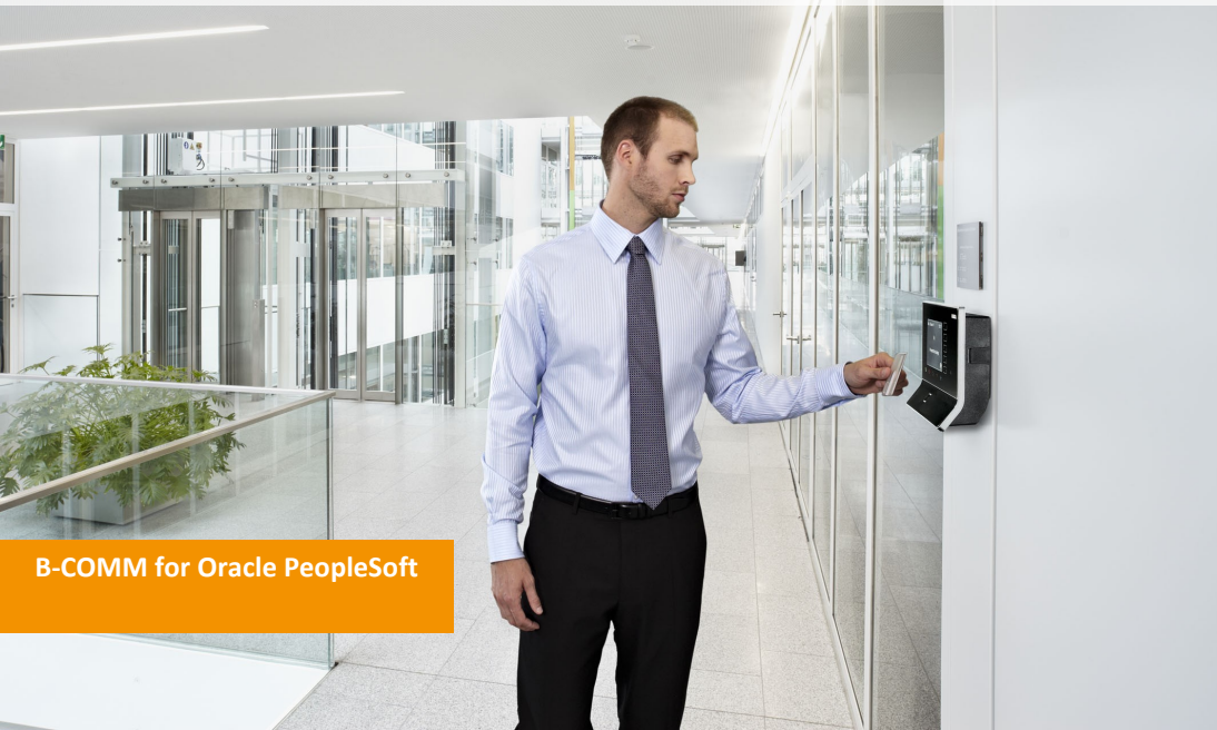
B-COMM for Oracle PeopleSoft